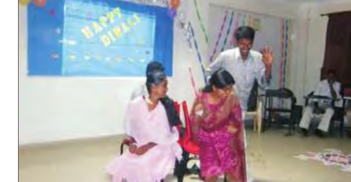
immersed themselves in the joy of lights.

Deepavali glorified and enlightened the minds of SNGIMSites on 03.11.2010. The crackers burst and students danced to the drum beats as the whole campus erupted with joy. Sweets were shared and everyone